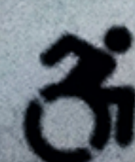
Image on front: In Her Interior, Her Eyes Were As Black As Coal... (still), 2019.

205 Hudson Gallery is an accessible space and there is ample seating in the gallery. For more information or to request assistive services, please call us at 212-772-4991 (voice only), or email hcag@hunter.cuny.edu .